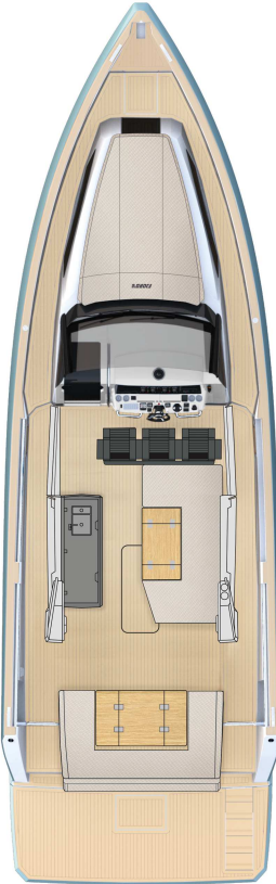
standard (optional stern cockpit table)